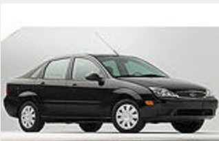
(Enlarge photo) 2005 Ford Focus

Shopping for an inexpensive set of wheels to take to college or get you to your first real job? We charged the Edmunds.com editors with the task of coming up with a list of cars that are relatively inexpensive to buy, cheap to own and insure (based on our own True Cost to Own data), reasonably fuel-efficient and safe, and in most cases, likely to provide you with years of reliable service. Unlike other such lists that are little more than guides for parents eager to put their children into safe but boring econoboxes, we know that fun and image are often on the minds of younger buyers (and auto journalist types as well). Fortunately, there are plenty of cars on the market today that offer a little entertainment behind the wheel and look appealing in the parking lot, while still keeping prices at a respectable level. Additionally, aftermarket parts are widely available for many of the models we chose — good news for the growing number of drivers who want to customize their cars. Finally, you'll notice that there are no under-$10,000 subcompacts on this list, and that's because we feel that if your budget is tight, you'll benefit much more from a used car that's larger, better-performing and more crashworthy.