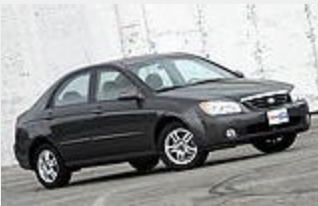
(Enlarge photo) 2004 Kia Spectra