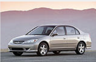
(Enlarge photo) 2005 Honda Civic