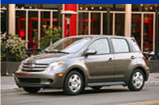
(Enlarge photo) 2005 Scion xA